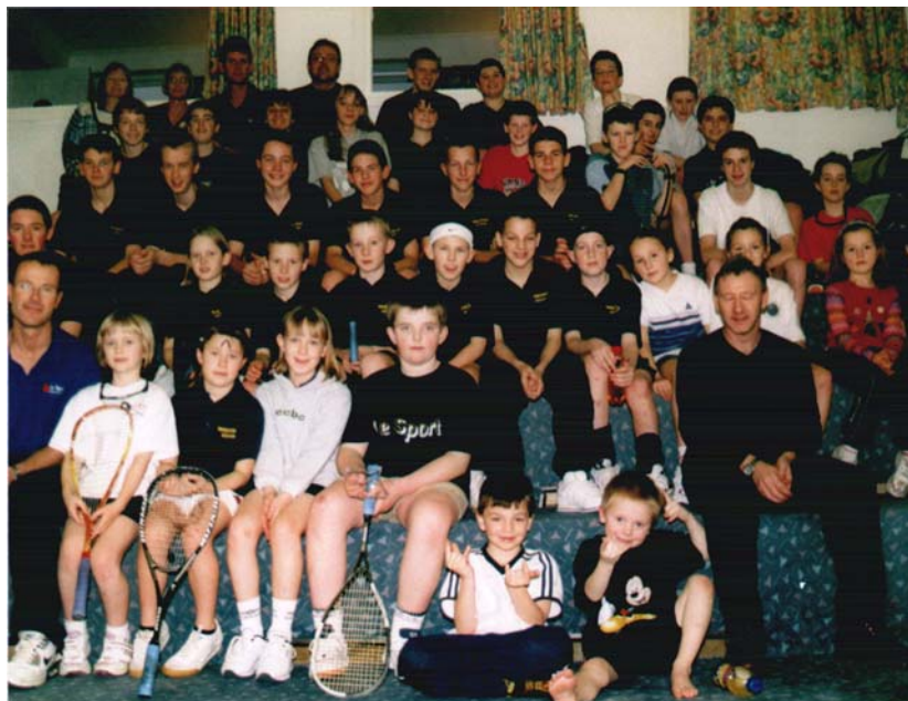
Wrexham Squash members following the friendly match with Le Sport Juniors at Colwyn Bay—December 2002